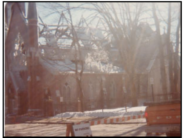
St. Mary's Church The Day After the Fire February 4, 1978

In the early evening of Feb. 3, 1978, during sub-zero weather, a 14 year old arsonist set ablaze the beautiful St. Mary's Church. It was one of the worst fires in Bangor's history and it the worst act of vandalism in our neighborhood's history. The building was destroyed. The crucifix that hung behind the alter did not burn... "a miracle" the parishioners called it. The church had more than 50 stained glass windows...many were destroyed in the fire and by subsequent vandalism. But, six were salvaged and repaired. Fortunately, the school building was spared. There were three options for St. Mary's moving forward: 1.) repair and rebuild the church in its former design. This would cost $950,000 (the most expensive) and require a new boiler, a new adequate hall, new landscaping and paving 2.) Build a new church on the existing site (approximately $700,000) which would include a new hall and more office space or 3.) Build a new church in an entirely different location. Five acres of land on Ohio Street was donated to the church by a parishioner for this option. For $900,000 the new site would include the new church, better parking facilities, and lower operating and maintenance costs. Due to cost of rebuilding on the Cedar Street site and the limitations for expansion, the decision was made by members of the church to build